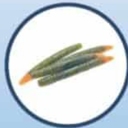
Soft Plastic Baits